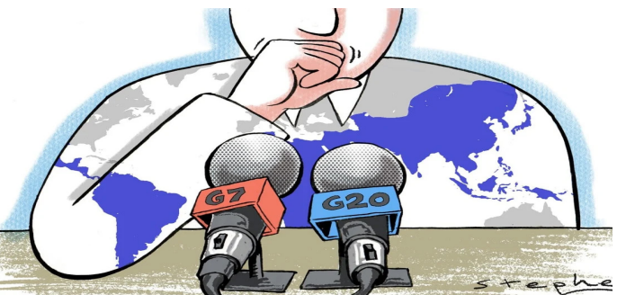
Illustration: Craig Stephens

https://www.scmp.com/comment/opinion/article/3213121/ g7-and-g20-japan-and-india-helm-must-ensure-global-southhas-voice-table 13 Mar 2023