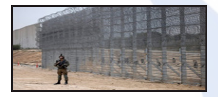
AP Photo/Tsafrir Abayov F

Israel announced that it had completed construction of a massive barrier running the length of the Gaza Strip both above and below ground. The $1.1 billion project is meant to end the threat of cross-border attack tunnels from the Palestinian enclave.