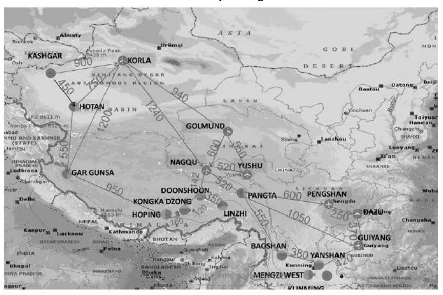
Fig 1: Distances in km between Airfields in Tibet and Adjoining Areas

Note: Distances in km between Airfields in Tibet and adjoining Areas, Author's own. Map not to scale.