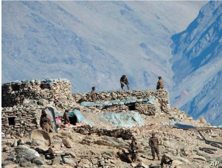
File - This photograph provided by the Indian Army, shows Chinese troops dismantling their bunkers in the Pangong Tso region, in Ladakh along the India-China border, Feb.15, 2021.

Last year, New Delhi and Beijing were involved in a months-long military standoff sparked by Indian accusations that Chinese troops had encroached into its territory in a remote mountain area of Ladakh in the western Himalayas during the winter, when the ice-covered area is largely inaccessible. New Delhi analysts had questioned why India could not detect the alleged Chinese incursions earlier through satellite imagery.